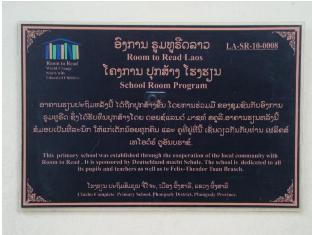
The dedication plaque for the new school